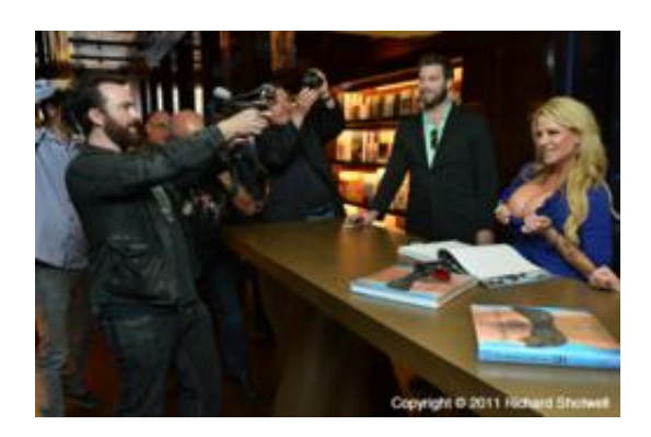
The Big Book Of Pussy By Dian Hanson.pdf